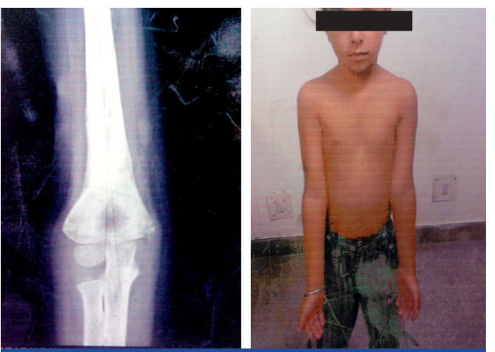
[Table/Fig-7]: Final follow-up X-ray and clinical photo.